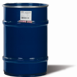
75 kg drum

For further information about our products, please visit our website ( www.vale.com ) or contact a regional sales representative.